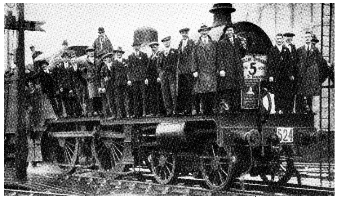
Blue No.5. Excursion Train at Warrington Bank Quay 8 a.m. 20th September 1930

The above photograph shows some of the party at the start of the excursion at Warrington Bank Quay Station. The locomotive was built at The Vulcan, and is one of the ex-MR Type, 3 cylinder compounds, many of which were built in the earlier years of this century. This type of engine can be considered as the only successful compound to have ever been in extensive use in this country.