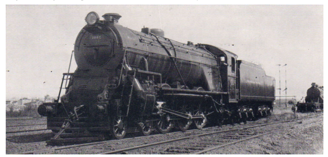
PS.11 Locomotive at R. de Escalada, General Roca Railway

Both water and fuel tanks are all-welded; in some cases the capacities are 9,000 gallons of water and 11.6 tons of oil fuel respectively, and in others 10,000 gallons and eight tons, this being according to the particular services for which they were destined.