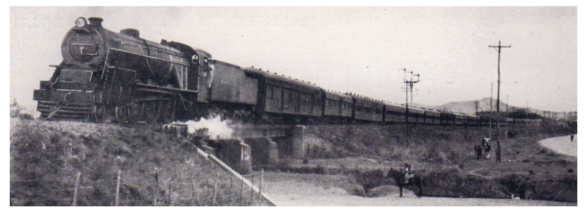
PS.11 Locomotive with Express Passenger Train on the General Roca Railway

Compensation is provided between all the underslung coupled springs, and the cast steel coupled axleboxes with bronze bearings are oil lubricated.